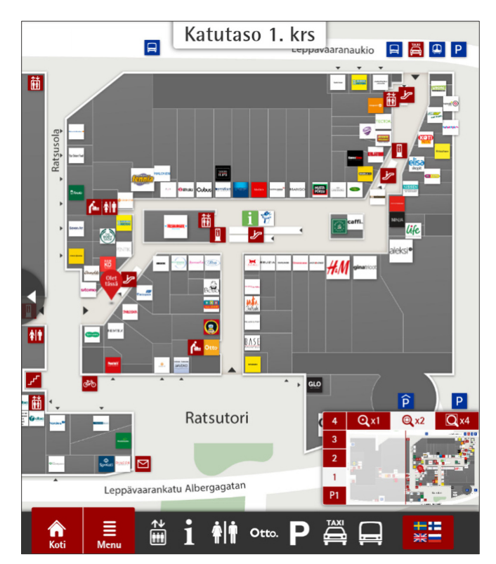
Site plan with information about the stores